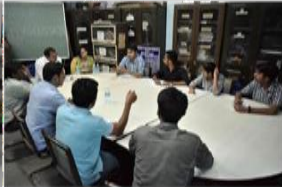
2. Group Discussion