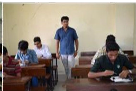
5. 'Mechanix' Event