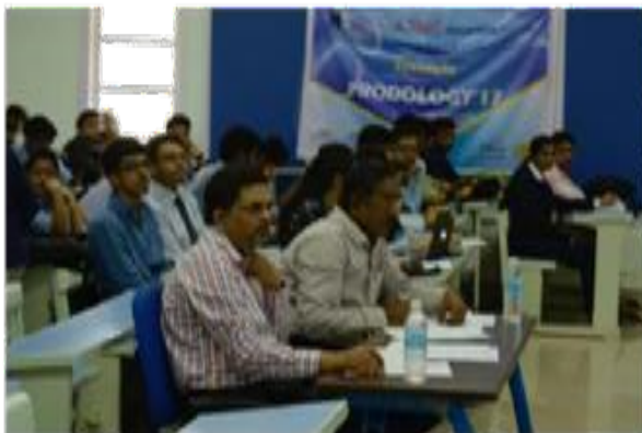
3. Technical Paper Presentation