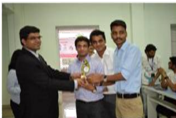
4. Prize Distribution Ceremony