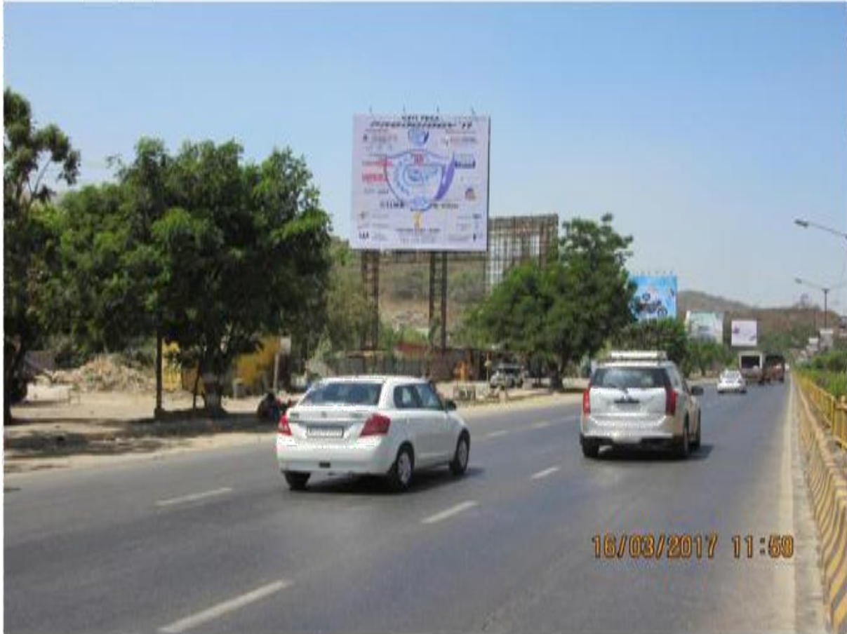
Outdoor Hoarding Advertisement – G B Road, Thane

Exclusive Banners and Standees of SAMPE USA were put up during Prodology 2017 as our Associate Sponsor.