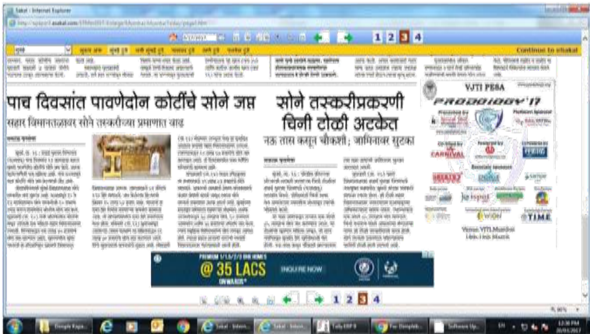
Newspaper Advertisement – Sakal Times, Mumbai