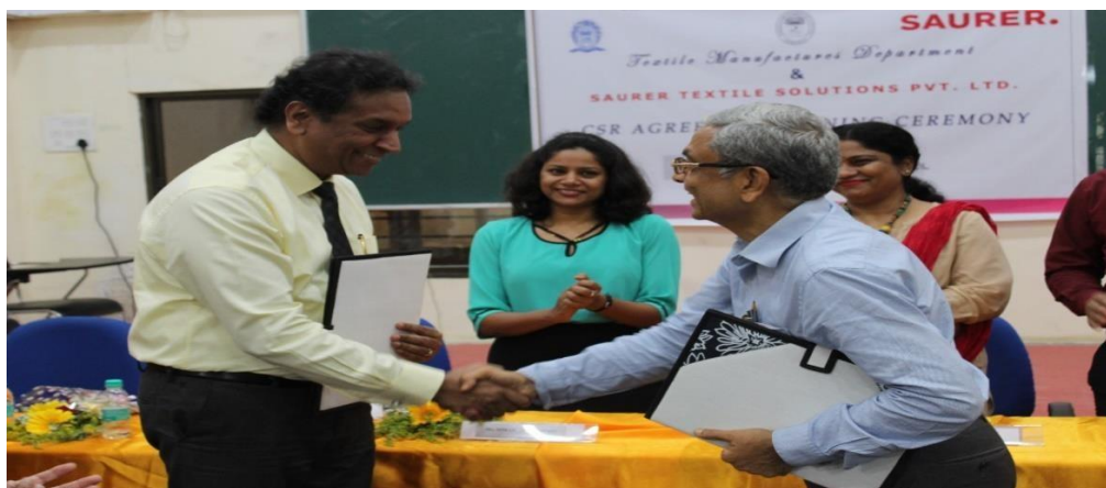
CSR (Corporate Social Responsible Responsibility) agreement with SAURER India PVT. LTD

CSR (Corporate Social Responsible Responsibility) agreement is signed by the department with SAURER India PVT. LTD on 14 th October 2018 for the development of infrastructure facility in the department also to create state of art of laboratory facility to promote the R&D activity in the textile and allied area.