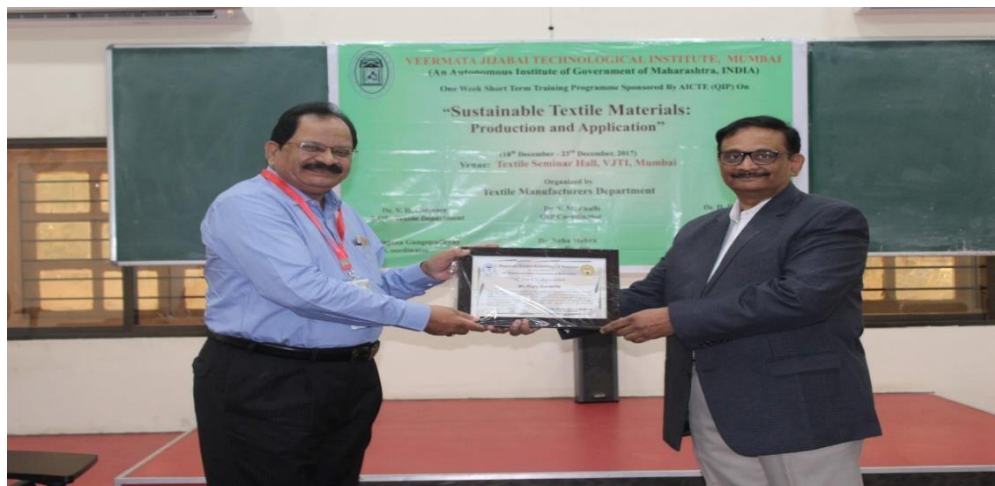
An AICTE sponsored QIP program on Sustainable Textile Materials: Production & Application