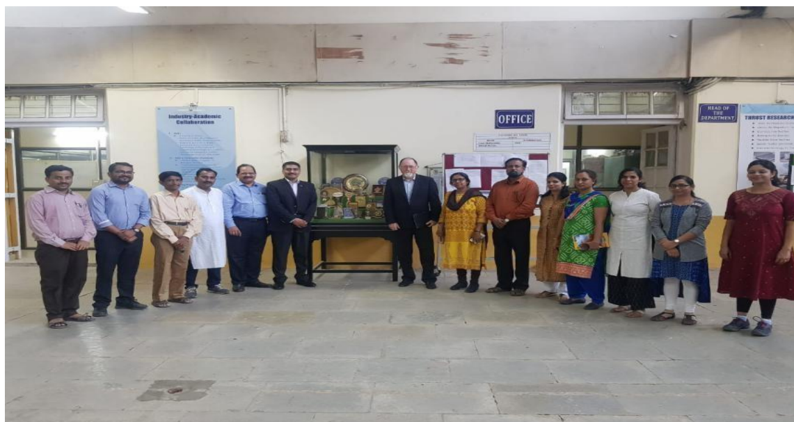
Wool Mark® Australia visit to the Textile Manufactures Department

On 13 th of December, 2018, Delegates from Wool Mark® Australia visited the department for conducting short term training program for the benefit of faculty in the area of recent advances in the wool fiber and its application in textiles.