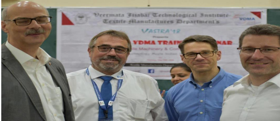
Delegates from VDMA visited the Textile Department

On 17th of May, 2018, Textile Department of VJTI hosted the Advanced VDMA Training Seminar where representatives of around twenty-one leading German manufacturers of Textile machinery interacted with textile students of India to appraise them about the latest developments in the Textile Machinery sector. The entire program is sponsored by VDMA - umbrella organization of German Textile Machine Manufacturers.