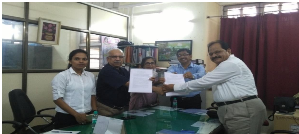
MoU Singed with Wonderweave Systems Pvt. Ltd.

On 14th October 2017, the department has signed MoU with Wonderweaves Systems Pvt. Ltd. The main objective of this activity is to provide the comprehensive knowledge to the students as well as the faculty members about the computer aided design in the field of textiles also to arrange the tailormade training programs for members of academia & industry.