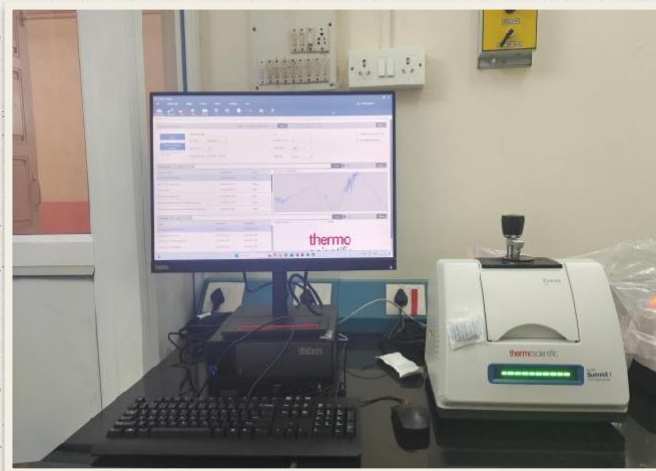
Fourier Transform Infrared (FTIR) with ATR (Make- Thermo Scientific)