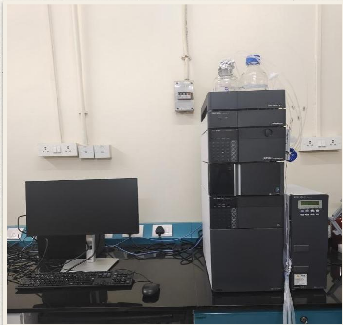
High Performance Liquid Chromatography (HPLC) – (Make-Shimadzu)